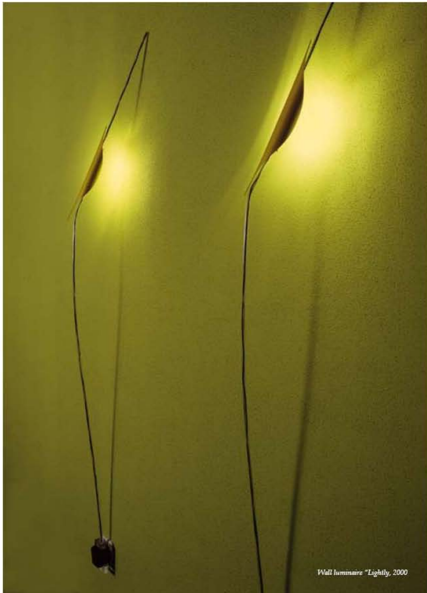
Wall luminaire "Lightly, 2000