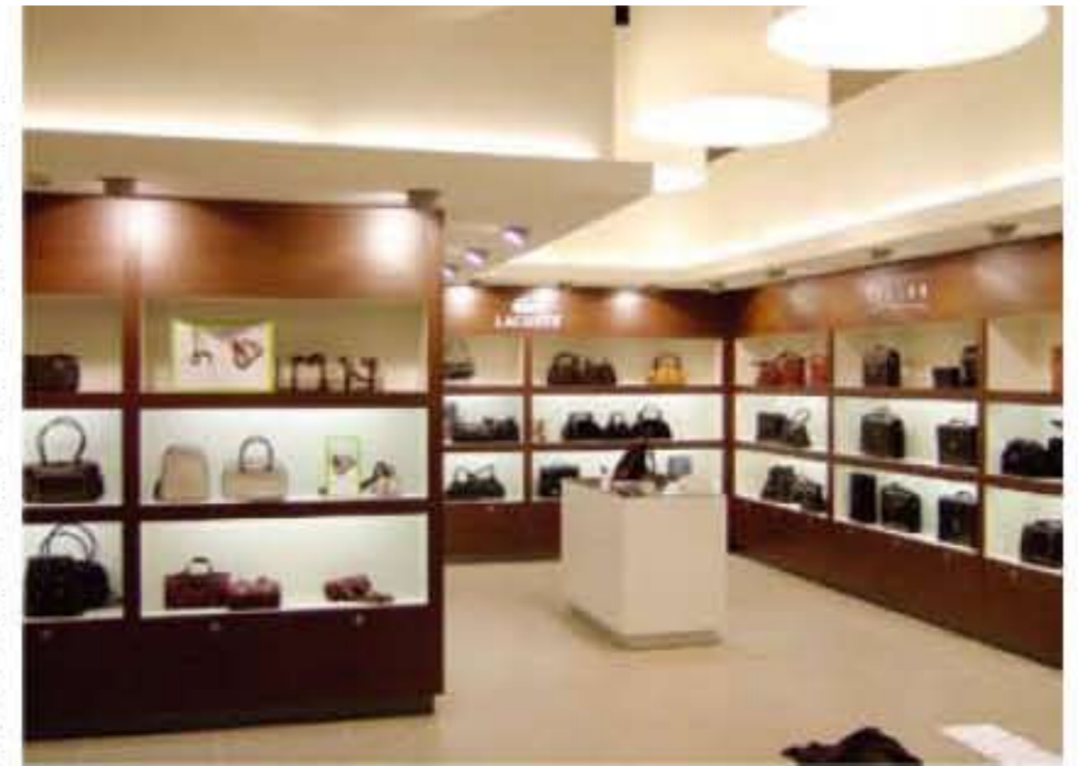
Interiors of the boutiques "Kalioniu opera" in Klaipeda and Vilnius, 2005 - 2007

And what comes next? In the today world flooded by various things, it is not sufficient to create a thing that is good in the aesthetical or functional aspects only. Design integration in various processes is needed. LTD duet perceives that. Taking the long view, the designers follow the principle that design should be good, not beautiful. Beauty can be only one of the components of the totality. In addition, they perceive that touching or using things form a certain mood. If such a mood is good, everybody will gain. As a majority of creating authors, they do their best to minimize the distance between their wishes and the needs of users. And abundant unrealized ideas are waiting for their turn in the motley of sketches.