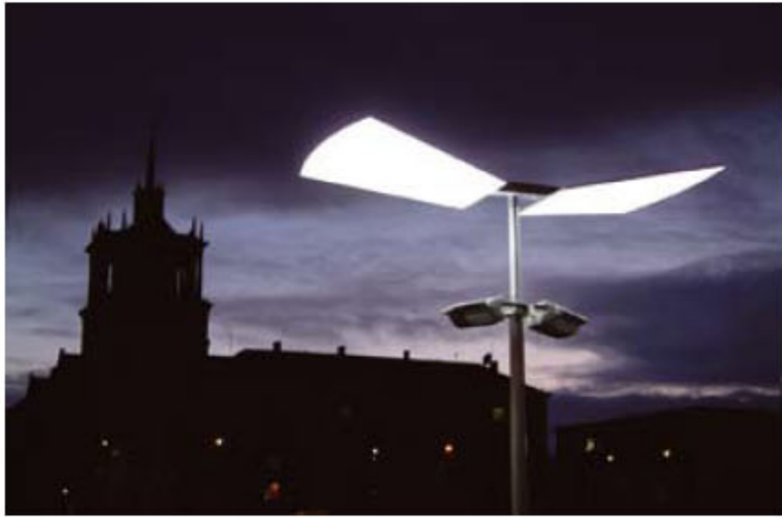
On the left: Outdoor lamp in Vilnius, 2006.